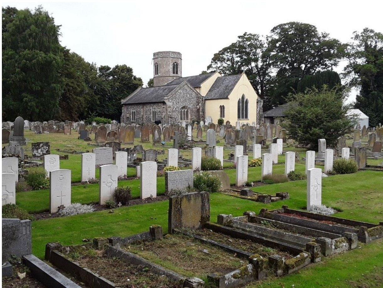
St Mary's Churchyard, Watton, Norfolk