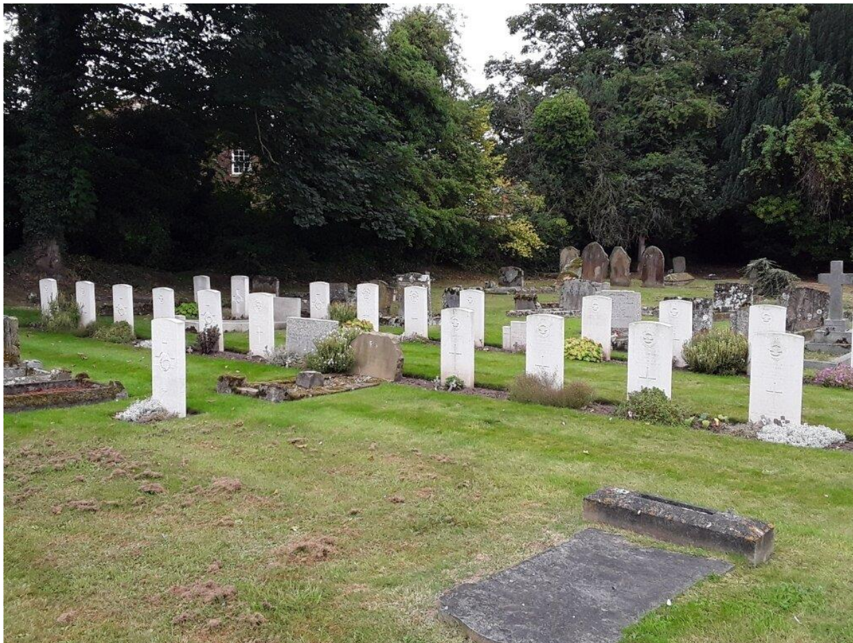
St Mary's Churchyard, Watton, Norfolk (Photos from CWGC)