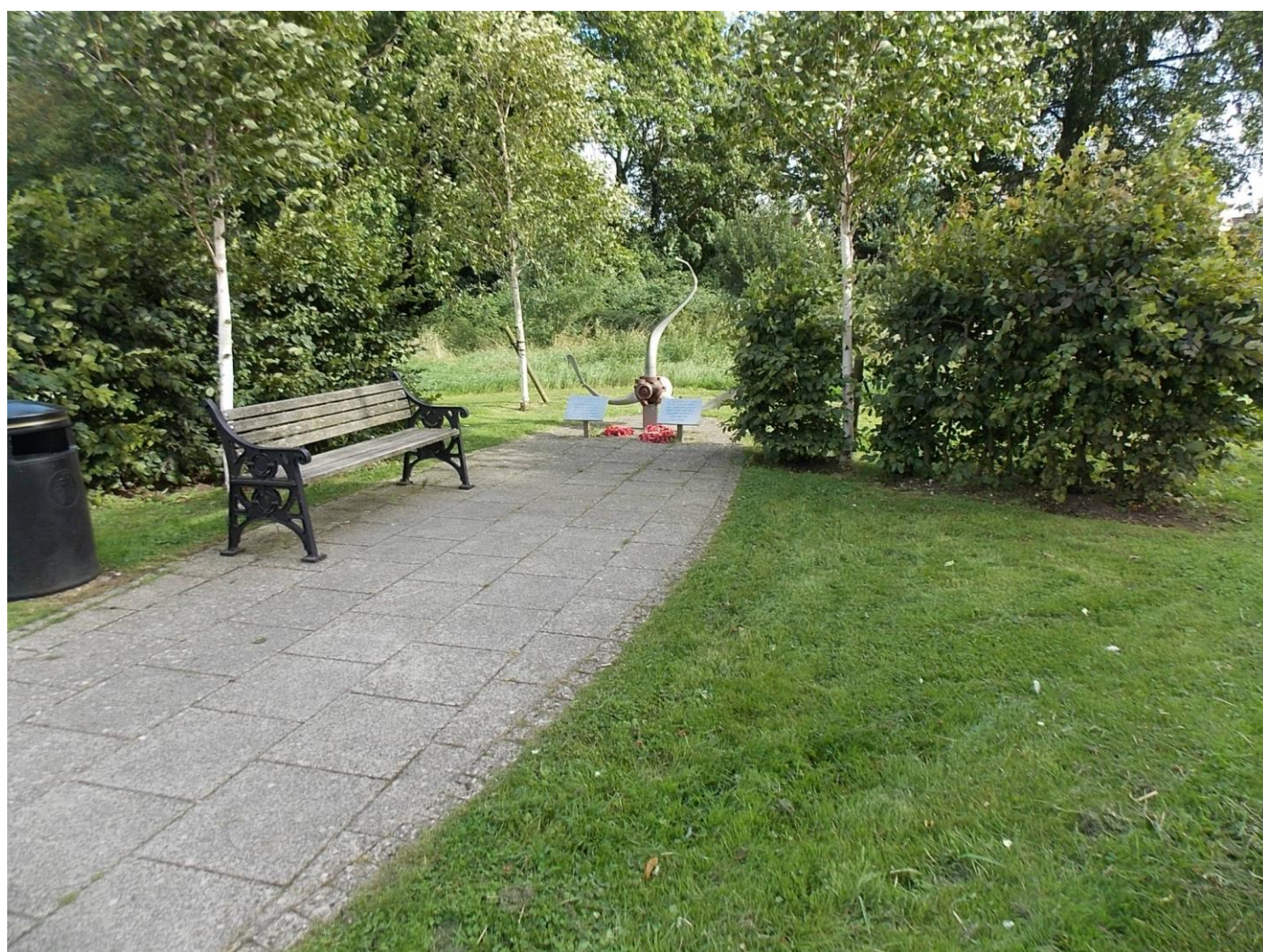
R.A.F. Watton Memorial

A Memorial to the memory of those of the Royal Air Force and Commonwealth Air Forces who lost their lives while serving at R.A.F. Watton and Bodney is located at the entrance to the former R.A.F. Watton, Canberra Road, Watton, Norfolk, England.